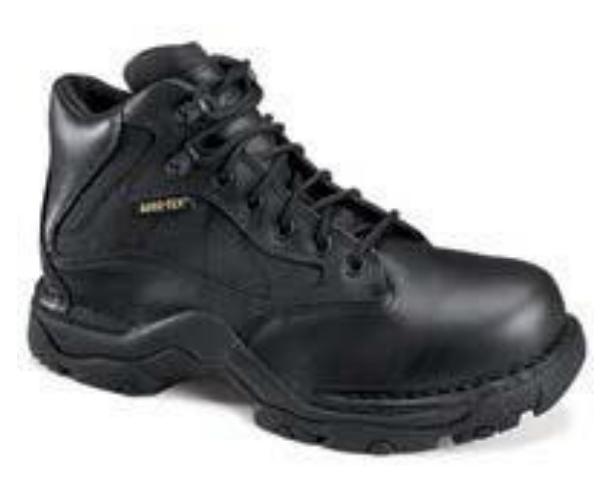
#5 is acceptable if lettering on label is blacked-out.