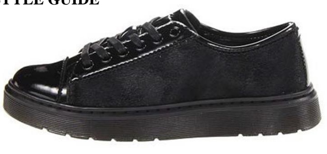
#31 is acceptable is writing is blacked out