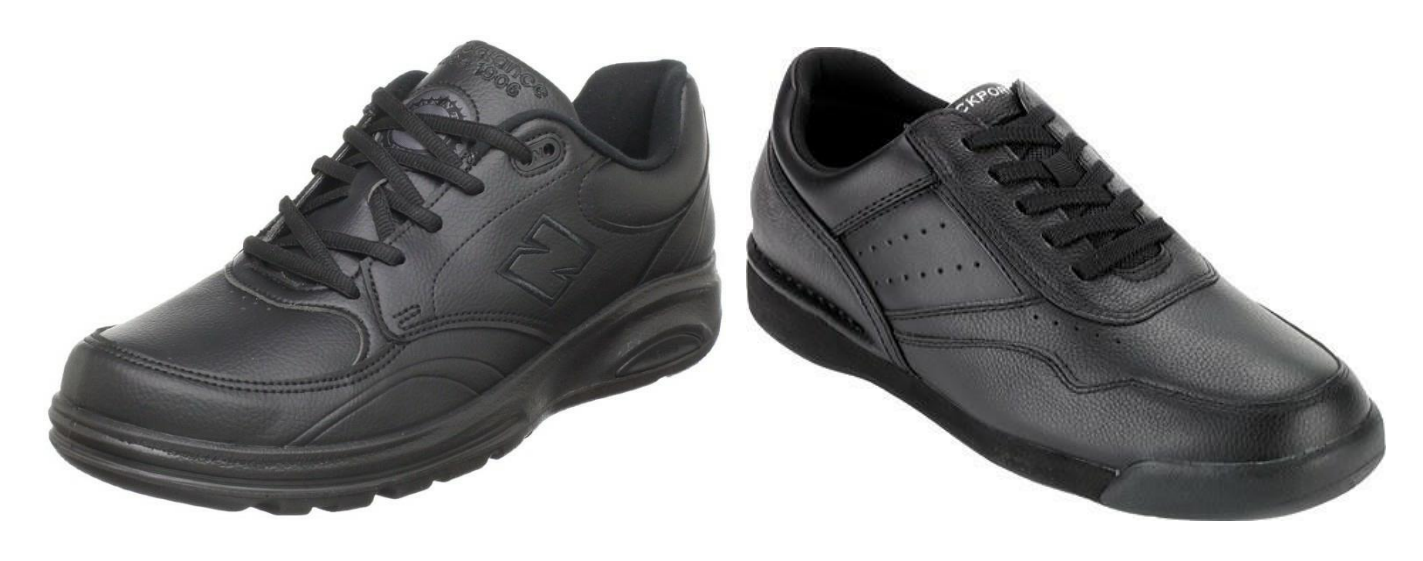
#17 acceptable is writing is blacked-out.