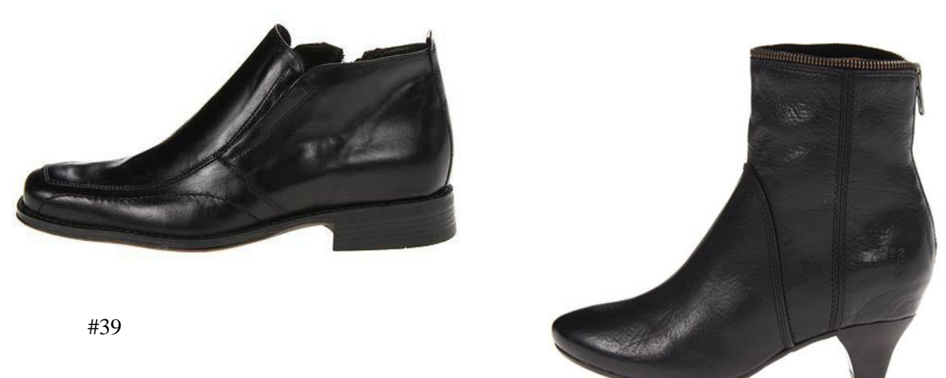
#40 is acceptable if heel height does not exceed 2" Not authorized for wear with shorts.