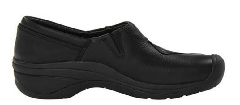
#33 is acceptable if heel height dies not exceed 2"