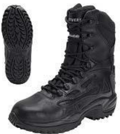
#8 is acceptable if writing is blacked-out or covered by trousers. Not authorized for wear with shorts.