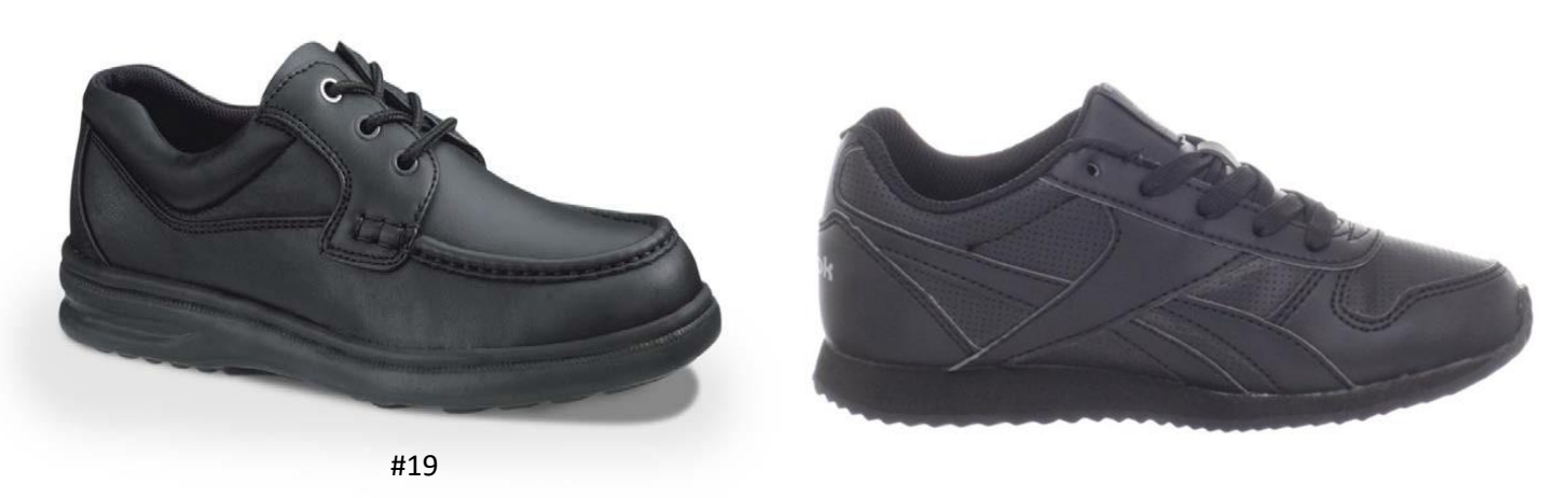
#20 is acceptable if writing is blacked-out

The style examples in the Appendix are illustrative and provided solely to represent some, but not all, types of acceptable footwear to be purchased by Transportation Security Officers and work while in uniform. TSA does not endorse any particular brand.