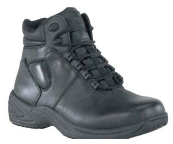
#6 is acceptable if heel height is not higher than 2 inches.