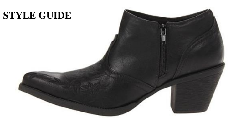
#22 is acceptable if the heel height does not Exceed 2". Not authorized for wear with shorts.